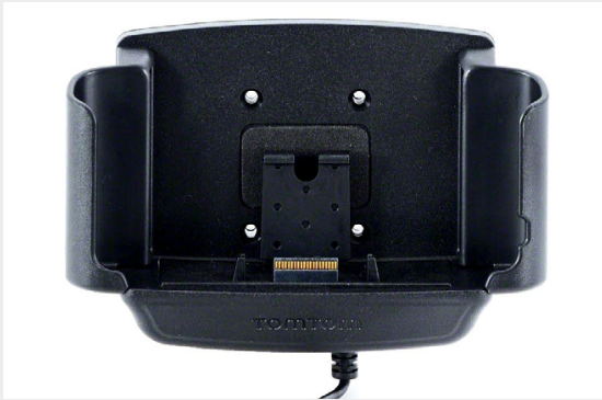
TOMTOM 5350 FIXED CRADLE