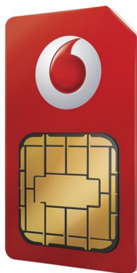
VODAFONE SIM CARD STANDARD OR DATA ONLY BOTH 3G / 4G