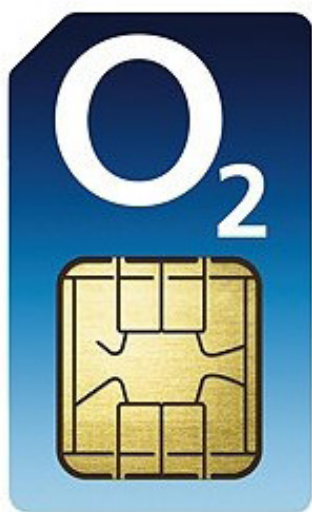
O2 SIM CARD STANDARD OR DATA ONLY BOTH 3G / 4G