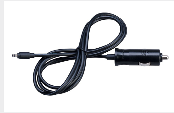
CAR CHARGER BRIDGE