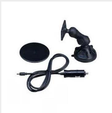
RAM BRIDGE WINDSCREEN MOUNT