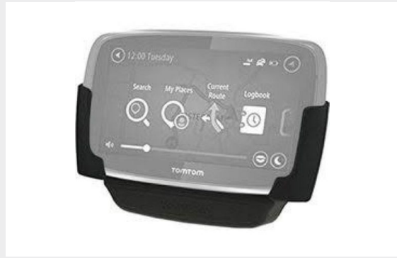
FIXED MOUNT FOR PRO 7350