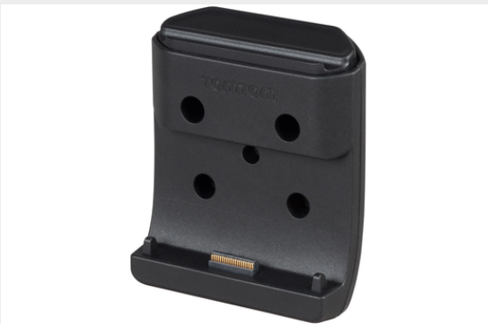
TOMTOM STANDARD CRADLE (REPLACEMENT)