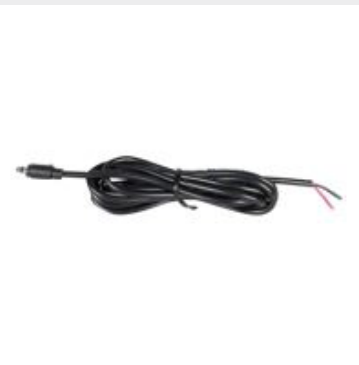
TOMTOM CHARGING CABLE BRIDGE